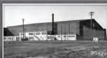
BIG BEAR ICE ARENA

★ on the National Registry of Historic Places