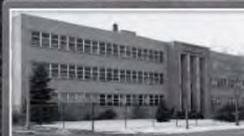
CO ALLERGY & ASTHMA CENTERS

The "Black Shack" got its name because of the "secret" ops that were performed inside. Airmen were taught how to load a nuclear warhead on a Titan missile body.