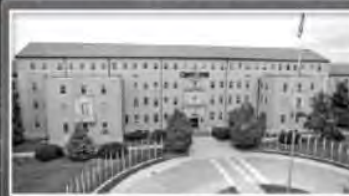
GRAND LOWRY LOFTS

★ on the National Registry of Historic Places